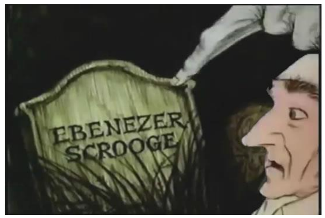
Finally the ghost showed Scrooge the tombstone of that man. It was his tombstone.